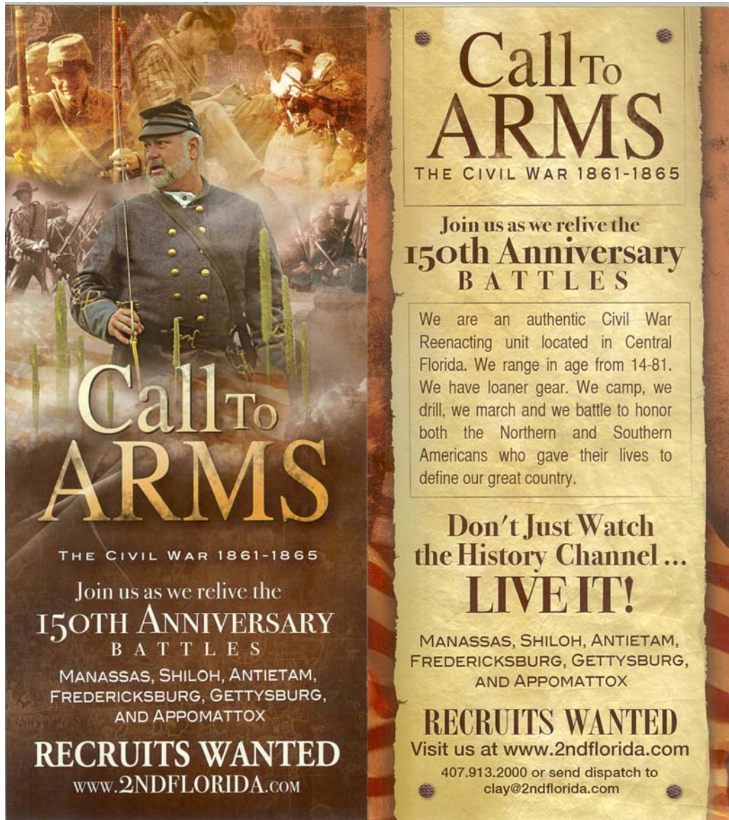
2nd Florida Volunteer Infantry newspaper advertisement.