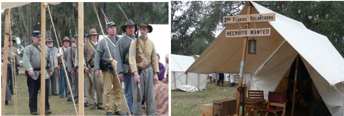
Mt. Dora - 2010