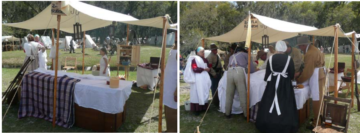
Narcoossee Mill – March 2010