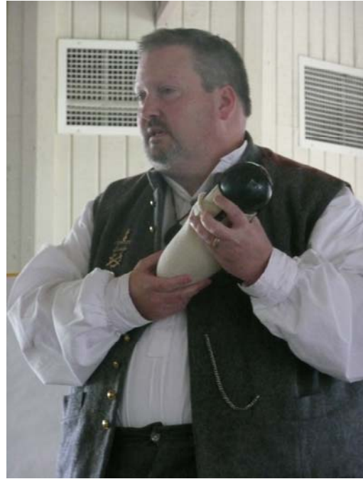
Artillery School Classroom Instruction.